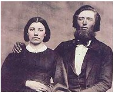
Charles and Caroline Ingalls