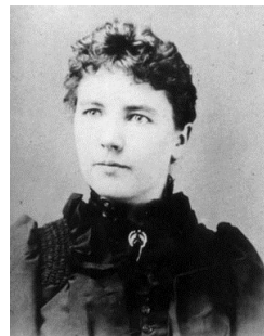
Laura Ingalls Wilder, approx. 27 years old

With no memory of her short time in Chariton County, Missouri, where she would have celebrated her second birthday, Laura never wrote about her family's brief time here, although other places she lived during her childhood affected her literary efforts and formed the foundation for the Little House on the Prairie series.