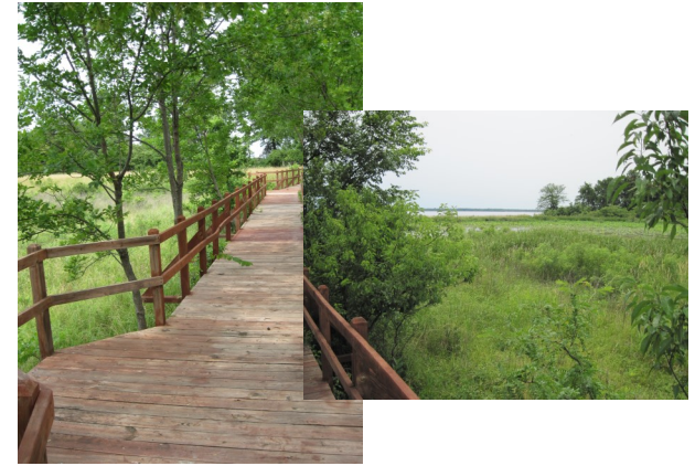
Strolling on the boardwalk

Silver Lake includes a goose hunting blind, which is popular among photographers for getting that perfect picture.