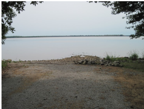
Silver Lake's Boat Ramp

Boating is easy on Silver Lake. Non-motorized boats are permitted throughout the refuge and motorized boats are allowed on Silver Lake (no wake allowed). The lake also includes a boat ramp, providing quick access. For those wanting to fish on the piers, Silver Lake includes three fishing piers.